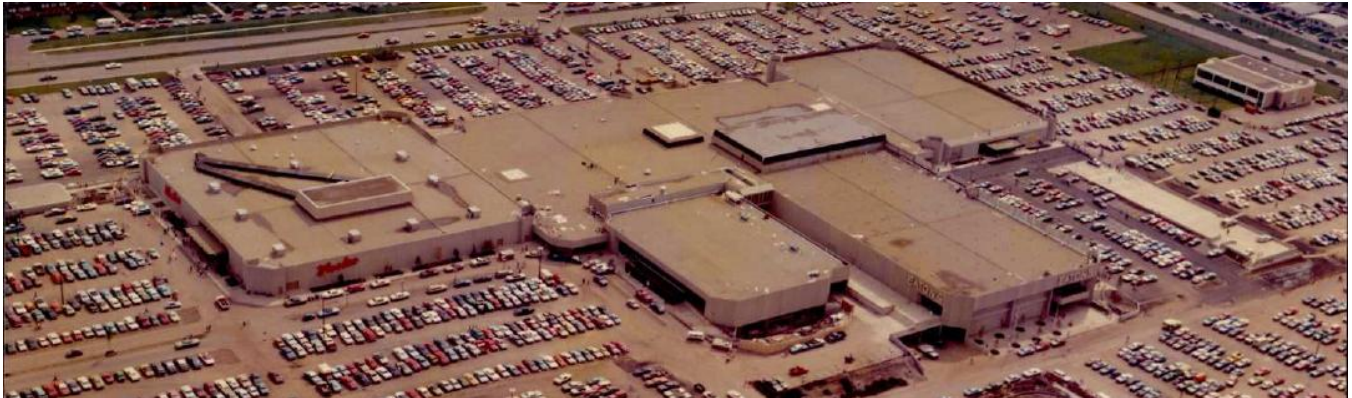
Aerial view from the north-west showing the Woolco anchor (left) and the Safeway and Eaton stores (centre).