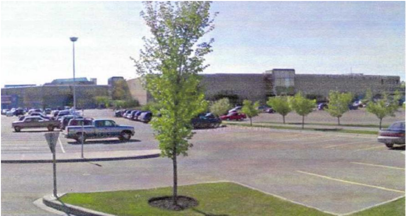
View of Bay store component from 107 th Avenue SE.