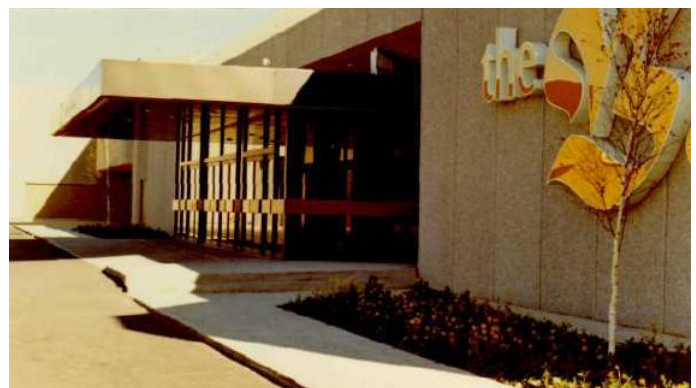
View (left) of main 66 St. NW entrance to the Bay store and view (above) of the Bay store entrance at the 137 Ave. NW façade at the upper level.