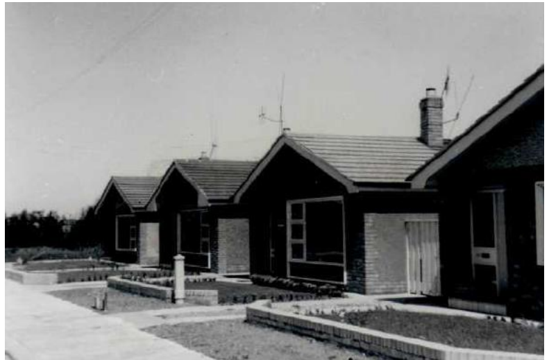
Housing sub-division Rhyl UK 1960

Further design work followed in the early mid sixties (while employed as a designer with GCB Associates in London UK) while employed as a designer with GCB Associates in London UK with the design of three custom luxury homes, employing the Provencal style of architecture, in Valbonne A.M. France.