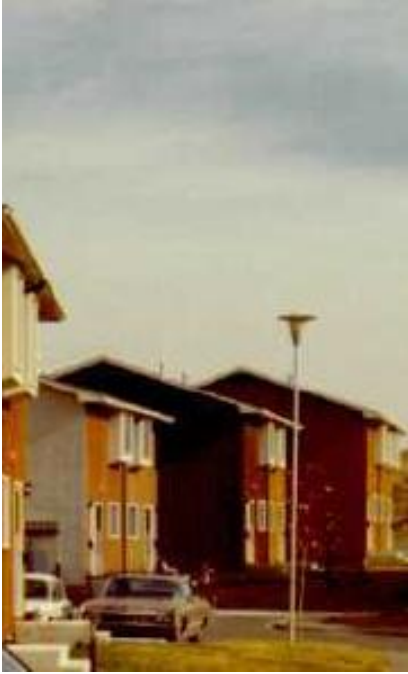
Gladstone Park, Calgary AB 1974